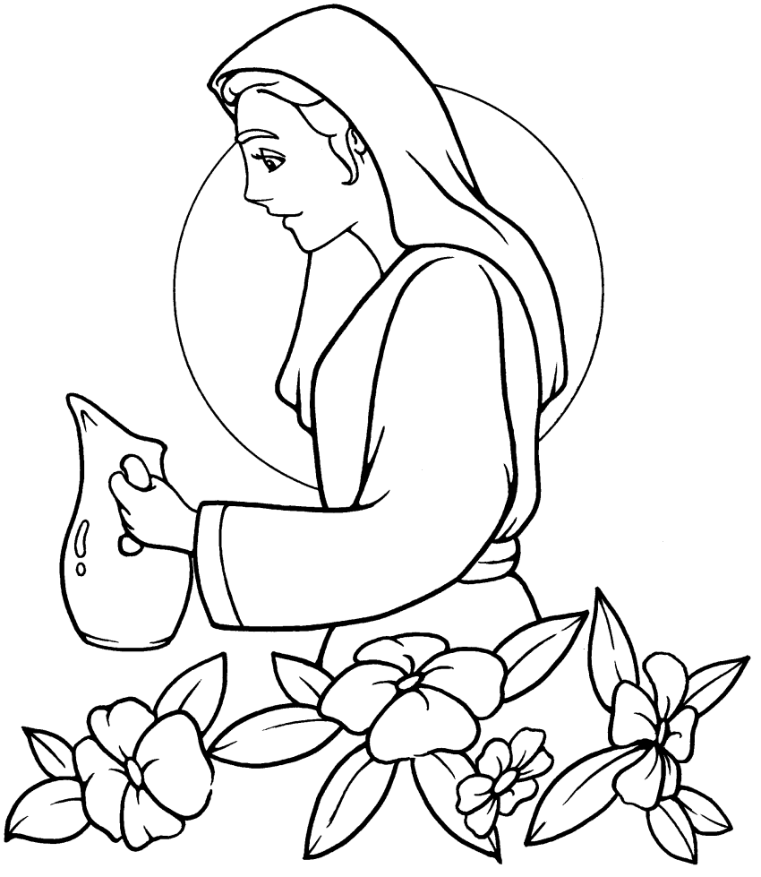
A Bride for Isaac Genesis 24:1-67